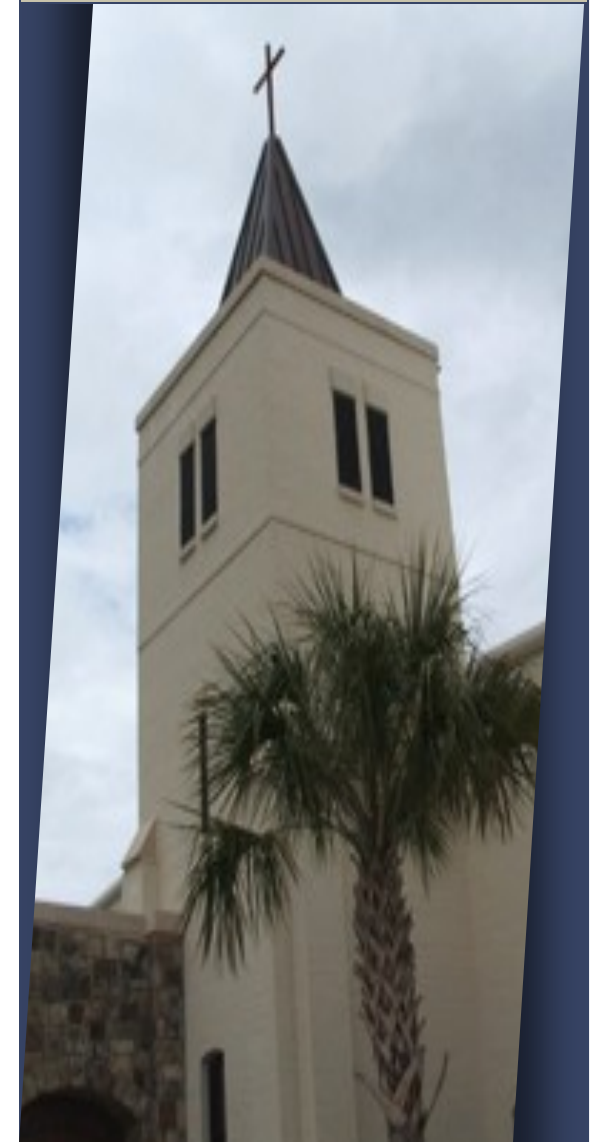
CHRIST CHURCH OF THE CAROLINAS